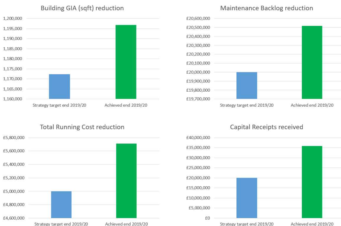
Table 3. Corporate Property Strategy 2015-2020 targets, all exceeded by March 2020.

Table 3 shows, all four Property Strategy targets have been exceeded at the conclusion of financial year 2019/20.